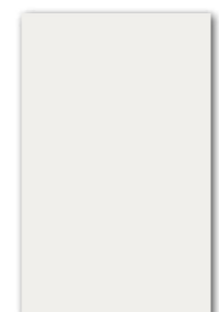
9A3V20 Day Bianco Lucido 25x40_9 13/16 "x15 3/4 " 48