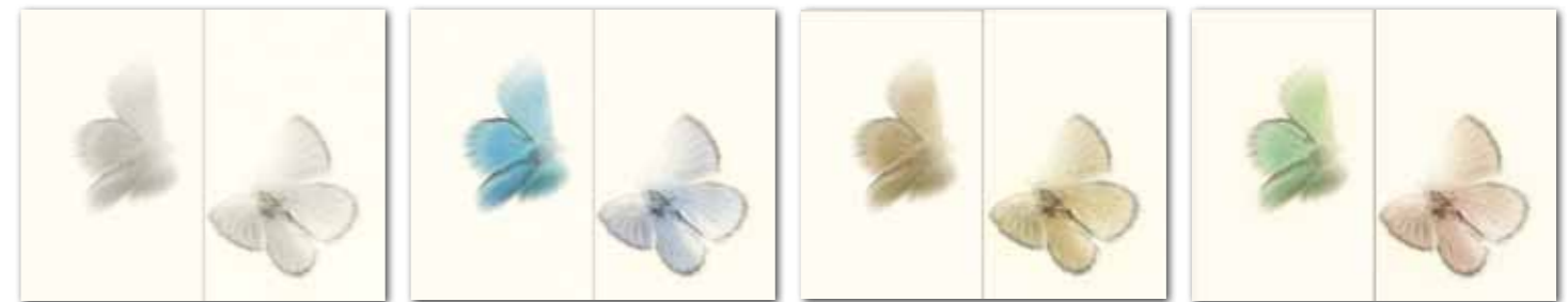
TD2022 Dayflight Grey Cp A/2 40x50_15 3/4 "x19 11/16 " 82 TD2020 Dayflight Blue Cp A/2 40x50_15 3/4 "x19 11/16 " 82 TD2021 Dayflight Beige Cp A/2 40x50_15 3/4 "x19 11/16 " 82 TD2023 Dayflight Multicolor Cp A/2 40x50_15 3/4 "x19 11/16 " 82