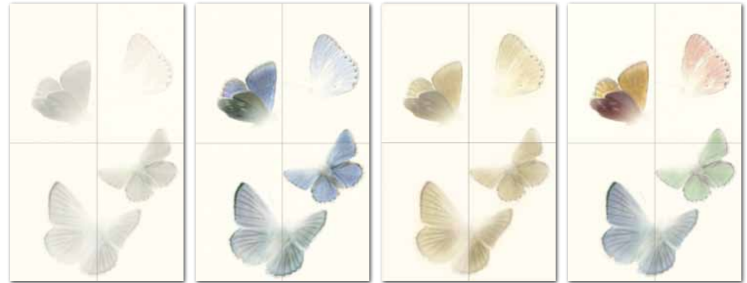
TD4032 Dayflight Grey Cp A/4 50x80_19 11/16 "x31 1/2 " 95 TD4030 Dayflight Blue Cp A/4 50x80_19 11/16 "x31 1/2 " 95 TD4031 Dayflight Beige Cp A/4 50x80_19 11/16 "x31 1/2 " 95 TD4033 Dayflight Multicolor Cp A/4 50x80_19 11/16 "x31 1/2 " 95