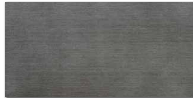
G4589R Hangar Black Rett. 45x90_17 11/16 ”x35 7/16 ” 72