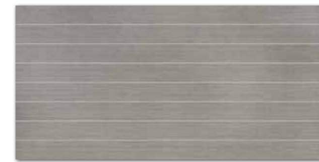
QF1643 Hangar Frames Grey Rett. 45x90_17 11/16 "x35 7/16 " 80