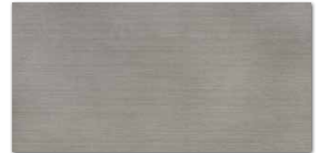
G4588R Hangar Grey Rett. 45x90_17 11/16 ”x35 7/16 ” 72