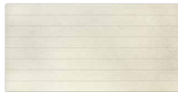
QF1640 Hangar Frames White Rett. 45x90_17 11/16 "x35 7/16 " 80