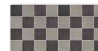
QFM501 Hangar Mos. Grey/Black 22,5x45_8 7/8 "x17 11/16 " 28