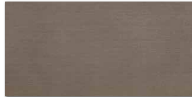
G4582R Hangar Brown Rett. 45x90_17 11/16 ”x35 7/16 ” 72