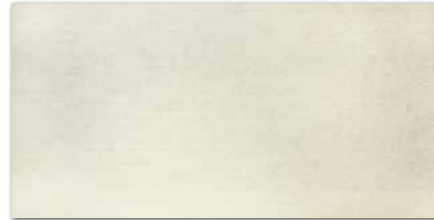
G4580R Hangar White Rett. 45x90_17 11/16 ”x35 7/16 ” 72