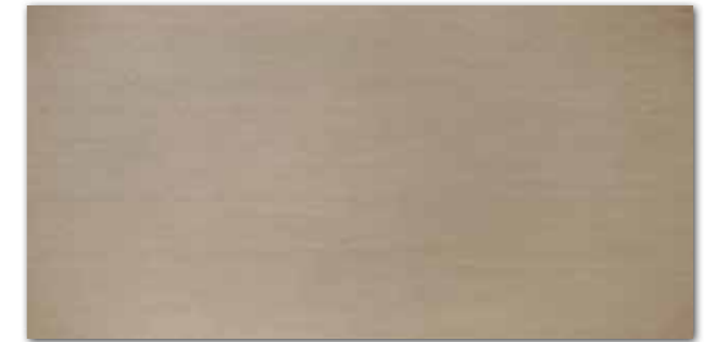
G4581R Hangar Beige Rett. 45x90_17 11/16 ”x35 7/16 ” 72