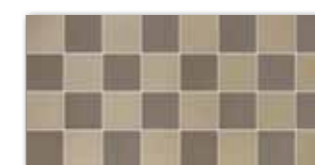
QFM502 Hangar Mos. Beige/Brown 22,5x45_8 7/8 "x17 11/16 " 28