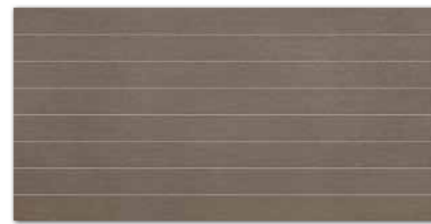
QF1642 Hangar Frames Brown Rett. 45x90_17 11/16 "x35 7/16 " 80