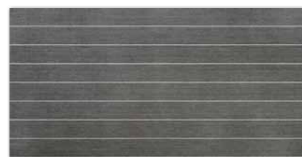
QF1644 Hangar Frames Black Rett. 45x90_17 11/16 "x35 7/16 " 80