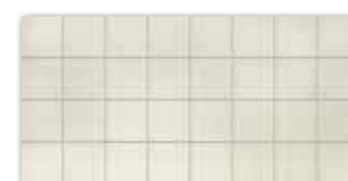
QFM500 Hangar Mos. White 22,5x45_8 7/8 "x17 11/16 " 28