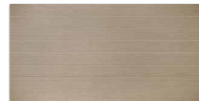
QF1641 Hangar Frames Beige Rett. 45x90_17 11/16 "x35 7/16 " 80